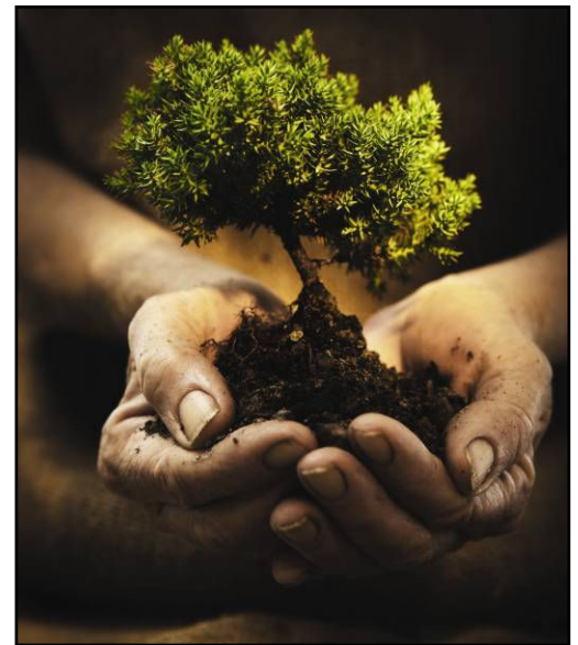
Lean Business Growth

The program is designed at giving key leaders within your business the correct lean mindset, tools and experience to move forward on the journey toward operational and business excellence.